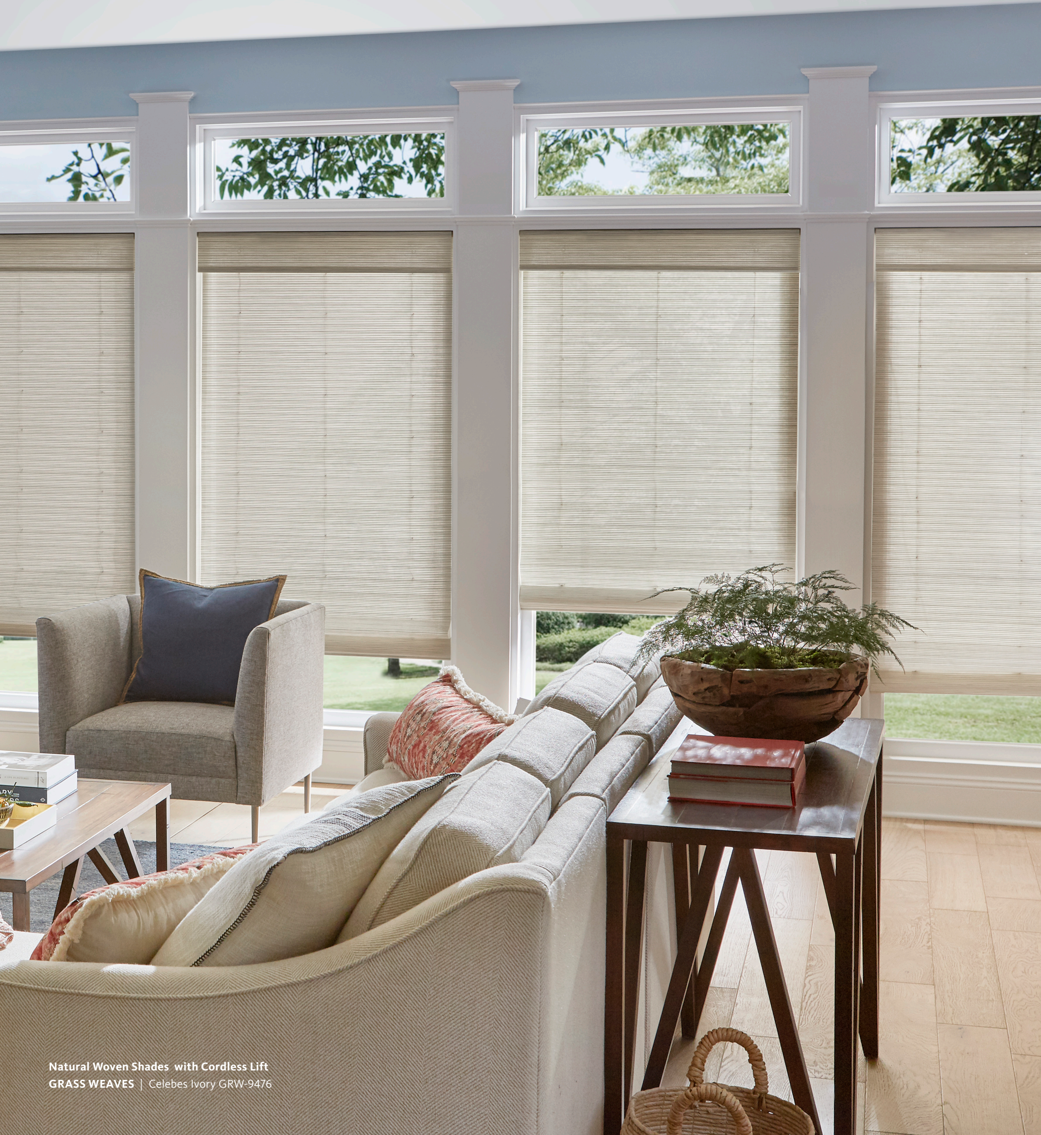
Natural Woven Shades with Cordless Lift GRASS WEAVES | Celebes Ivory GRW-9476