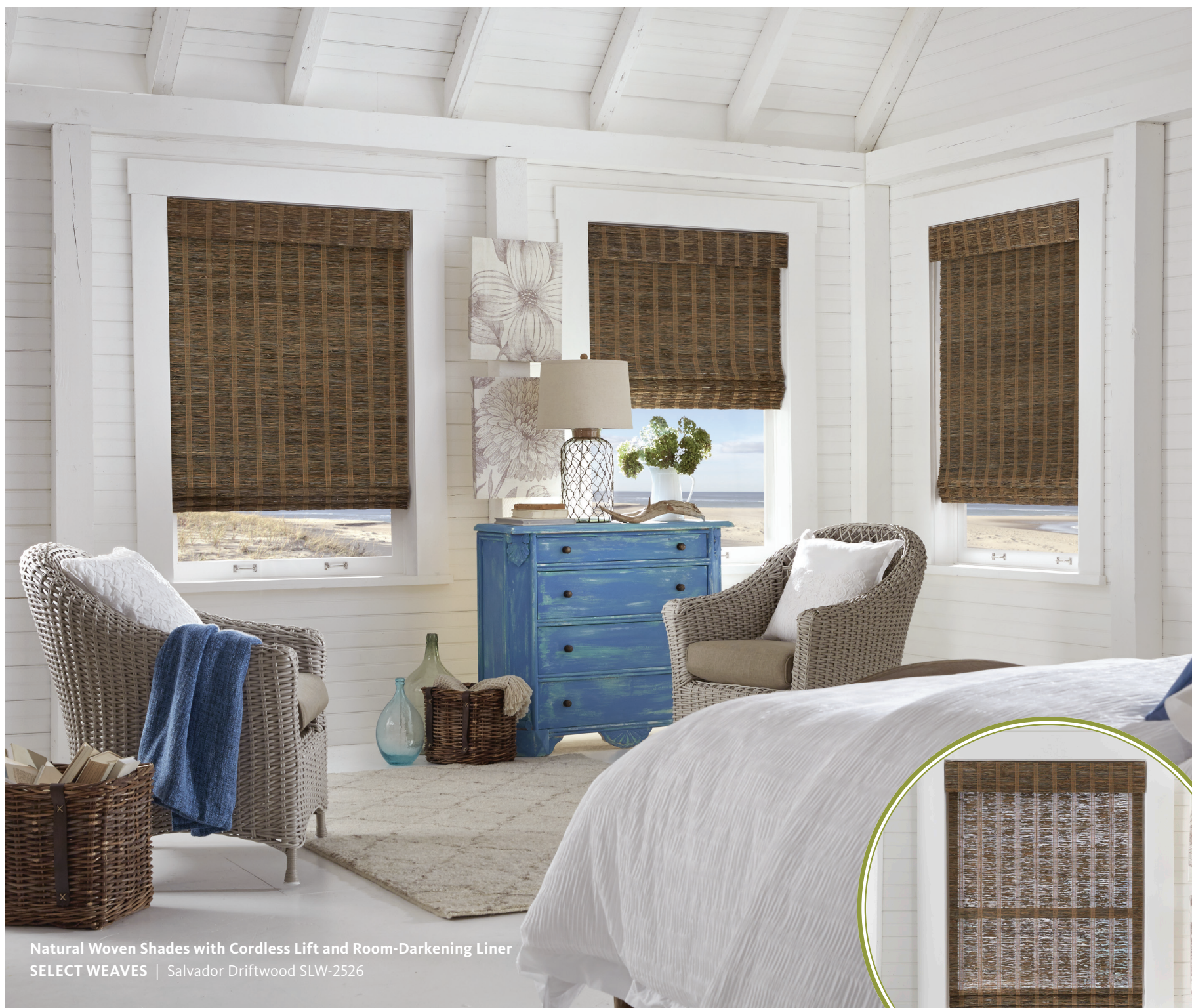
Natural Woven Shades with Cordless Lift and Room-Darkening Liner SELECT WEAVES | Salvador Driftwood SLW-2526

Alta's infinite quest to control light and privacy means innovative choices for Natural Woven styles. Our design options, including fixed liners and top-down/bottom-up, put you in command of your domain.