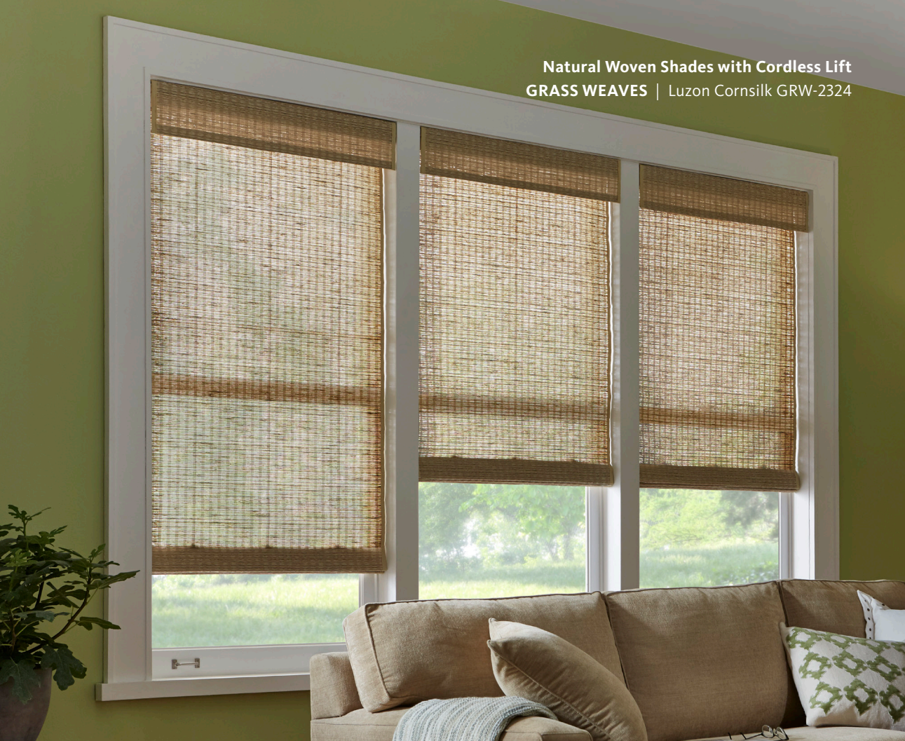
Natural Woven Shades with Cordless Lift GRASS WEAVES | Luzon Cornsilk GRW-2324