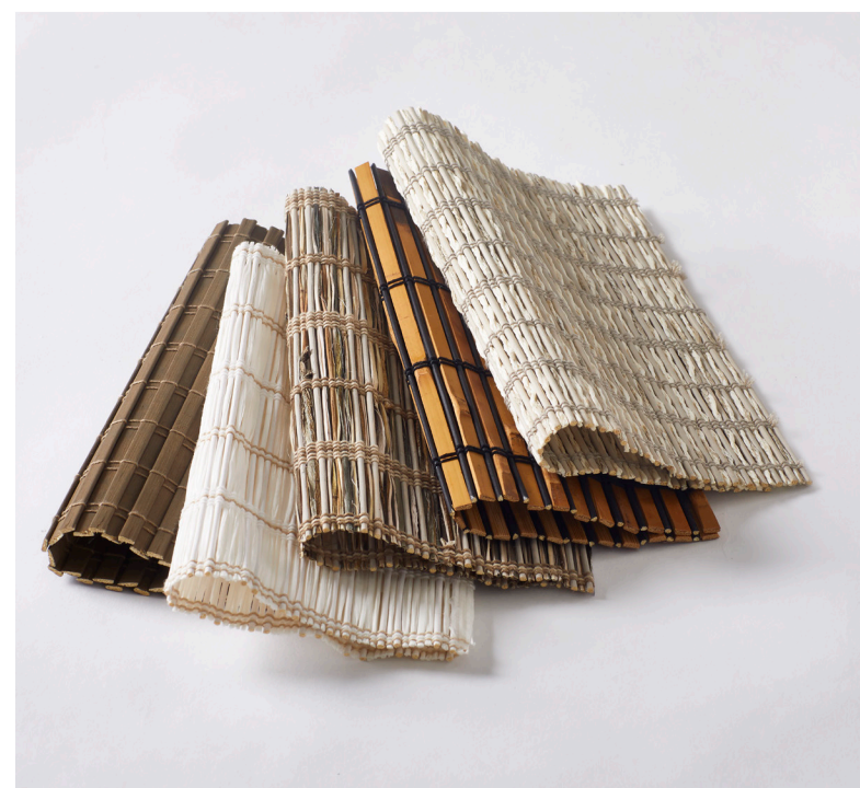
Natural Woven Shades Two-on-One Headrail with Automation WOVEN WOODS | Taos EXO-2232

Hand-split bamboo, wood, reeds and jute are eye-catching choices with the tactile feel of earth's bounty.