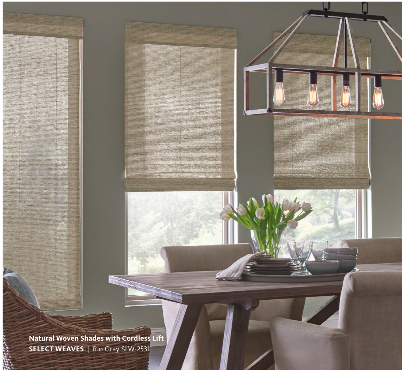
Natural Woven Shades with Cordless Lift SELECT WEAVES | Rio Gray SLW-2531