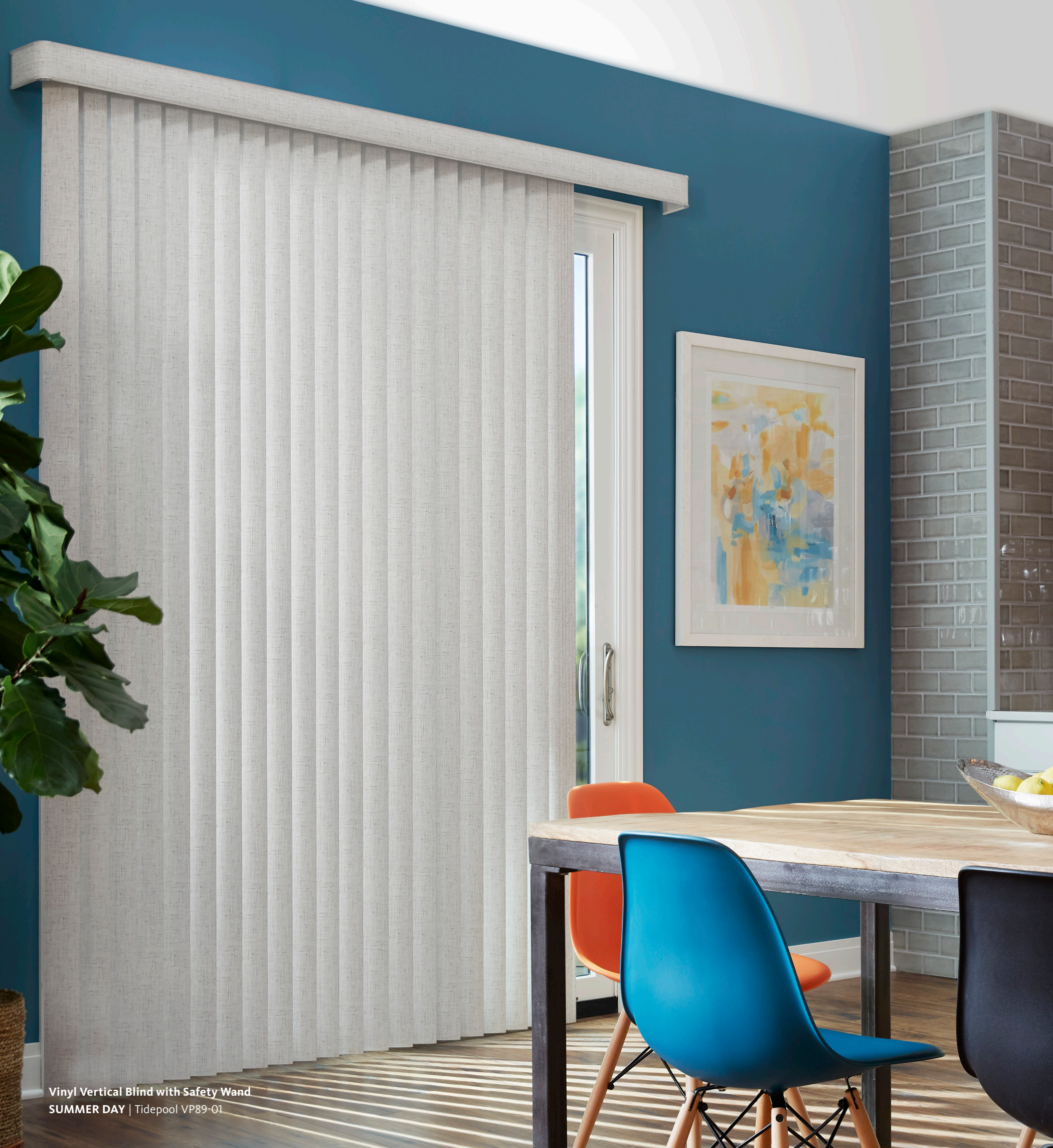
Vinyl Vertical Blind with Safety Wand SUMMER DAY | Tidepool VP89-01