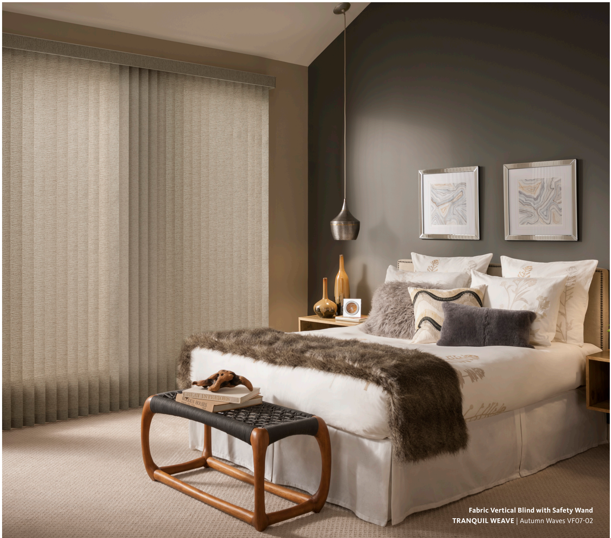
Fabric Vertical Blind with Safety Wand TRANQUIL WEAVE | Autumn Waves VF07-02

Alta stands by our products with a Limited Lifetime Warranty.