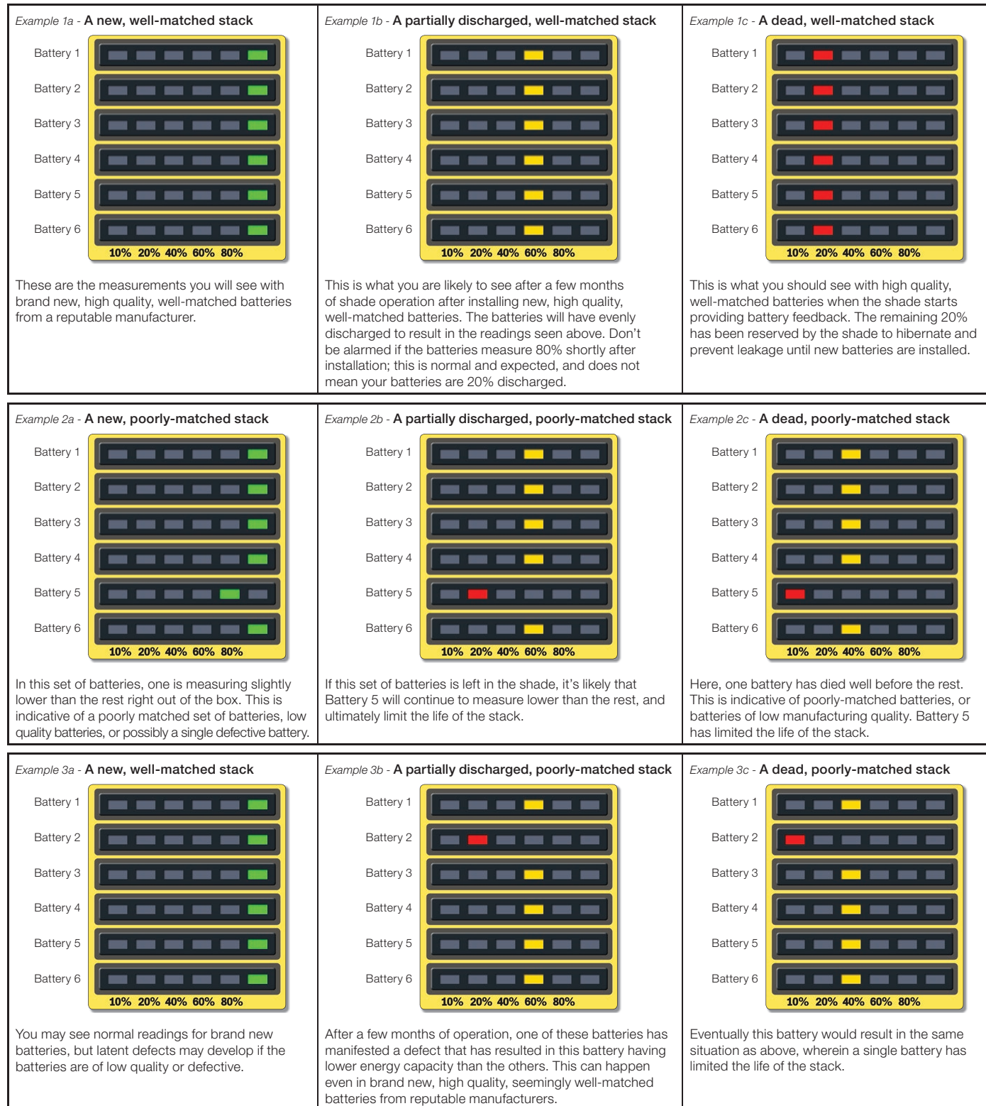
Figure 4.1 - MBT-1 readings representing various battery conditions

The technique described in section 3 can also be used to diagnose battery failures in shades. Once a shade provides battery related feedback (moving at half speed, slow RED blink, solid RED light), evaluate each of the batteries in the manner above. If one or more batteries is at a lower reading than the others, they were likely limiting the life of the stack. When replacing these batteries, be sure to use all brand new batteries from the same manufacturer, preferably from the same package. See figures 4.1 below for common examples you can expect to see when measuring batteries on the MBT-1 or Mini-MBT (MBT-1 6-LED graph shown).