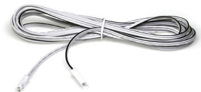
48" Battery Pack Extension Part # 62207000