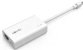
+ Ethernet adaptor (optional) 1870470

Maximize your smart home experience with Somfy-powered RTS motorized window coverings. Users can control shades, blinds, shutters, and lighting with a smartphone, tablet, or simple voice commands! The TaHoma® North America app lets users control these applications while home or away.