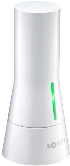
TaHoma® RTS 1811731