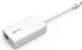
+ Ethernet adaptor (optional) 1870470

Maximize your smart home experience with Somfy-powered RTS motorized window coverings. Users can control shades, blinds, shutters, and lighting with a smartphone, tablet, or simple voice commands! The TaHoma® North America app lets users control these applications while home or away.